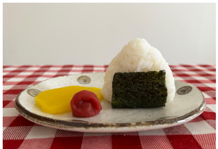
Figure 3: sample of Japanese traditional meal.