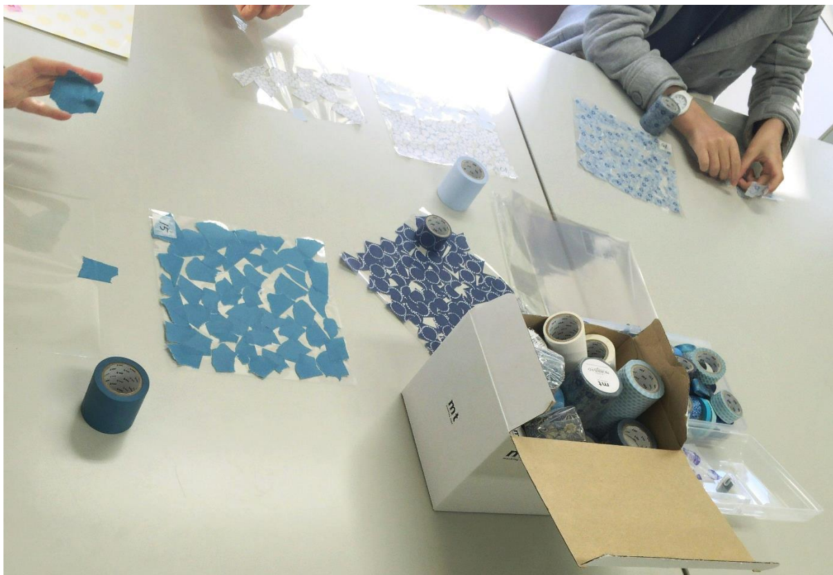
Fig 1: Attaching masking tapes to thin film sheets

The author's group originally conceived of this method during a workshop with elderly patients [6]. It