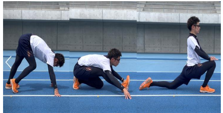
Figure 2: Spring stretch method for three target muscles.

The first author actually continued this spring stretch and training for a month [14] (Figure 2). Before and after the exercise, the dash time of 50m running was compared. As a result, the spring-like muscles revealed clinical efficacy. The running form has changed associated with more lifting of the knees and legs upward and forward. The time has improved from 7.15 sec to 6.51 sec, showing drastically running faster. Furthermore, certain confidence was emerged as “I can do it” from social and psychological points of view [16]. This report will be hopefully actually useful for athletes, medical staffs and related people.