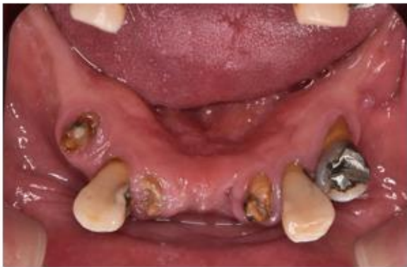
Figure 1: Image of residual teeth in the lower mandibulae.

His physique showed the first degree of obesity with 172cm, 100kg, BMI 33.8 kg/m 2 . He has no problems about consciousness disorder from hyperglycemia or hypoglycemia. The vital signs were normal. Blood pressure is usually 130/80 with anti-hypertensive agent. His lung, heart, abdomen was unremarkable and no specific diabetic neurological disorders were found.