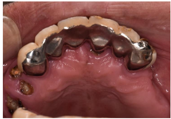
Figure 3: Image of teeth after temporary splinting treatment