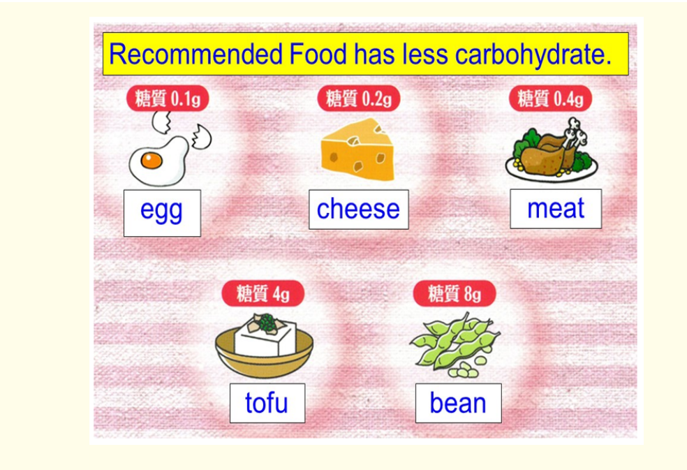
Figure 2: Recommended foods adequate for continuing LCD.

There are some recommended methods for continuing LCD. Some foods have fewer carbohydrate and certain protein from a nutritional point of view. Figure 2 shows the typical 5 kinds of food with fewer carbohydrates, such as egg (50g) 0.1g, cheese (20g) 0.2g, chicken meat (180g) 0.4g, tofu (300g) 4g and beans (100g) 8g [9]. When a person tries to LCD, the fundamental dishes include i) salad at first, ii) meat, eggs or fish (protein), iii) encourage liquids without sugar, iv) refrain from carbohydrate foods such as rice, bread, pasta, etc [11].