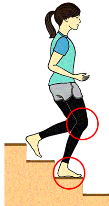
Figure 2: The image of step down the stairway with flat grounding and bending knee.

In this way, it is important to move the center of gravity forward and downward, and to place one foot on the lower step moving the weight. This is exactly the same as two-axis operation that moves the center of gravity to right and left in each step by flat grounding [9]. The grounded leg receives the center of gravity of the body. The knee is bent in response to the impact, with further lowering the center of gravity ( Figure 2 ).