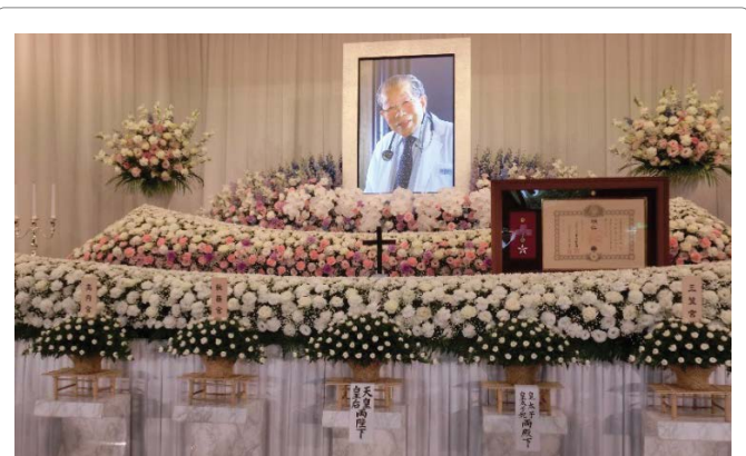
Figure 1: The picture of Dr. Hinohara and the Order of Cultural Merit (2005).

In this article, we would introduce the progress and achievement of Dr. Hinohara in each category 1)-4) with some investigation of his activities. Then his broad and deep philosophy called "Hinohara-ism" could be understood, leading to successful aging [2].